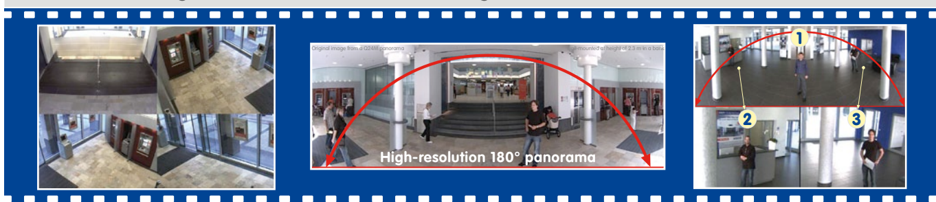
3 simultaneous views